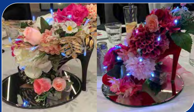
Innovative idea of Table Decorations.. Floral shoes for stepping up.