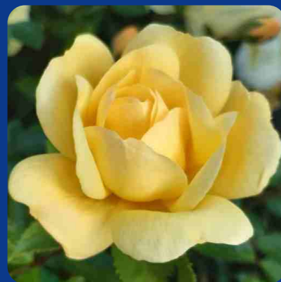
The Margarette Golding Rose