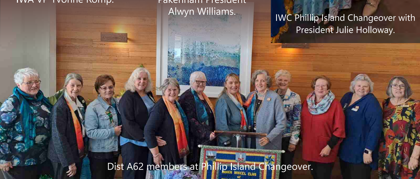
Dist A62 members at Phillip Island Changeover.