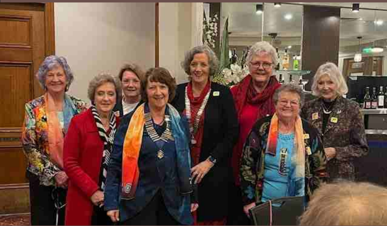
Members of the IWC of Wandin at the District A61 Changeover.