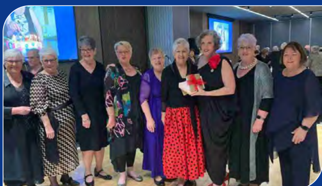
With Members of IWC Pakenham