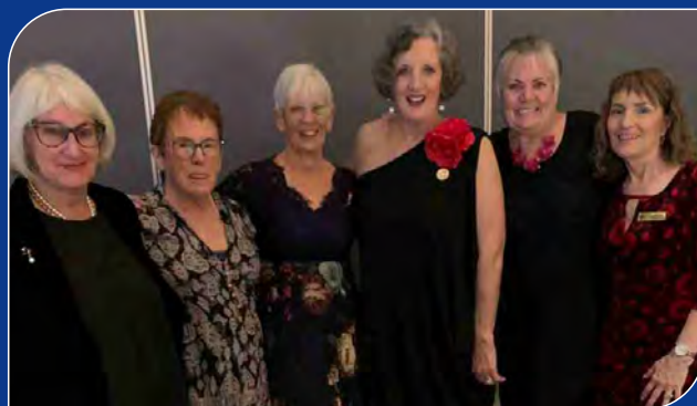
With IW New Zealand Members