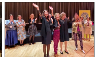
The team at the Gala Evening