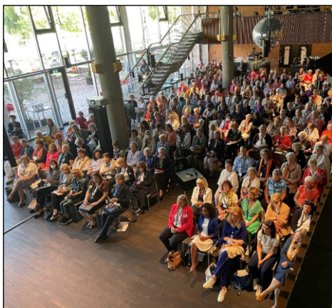
The Symposium: Strong women stay connected