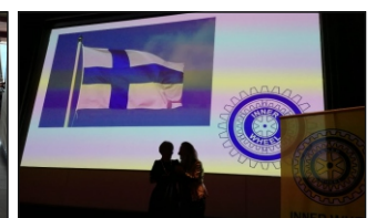
From Berlin to Helsinki! See you in September 2025!