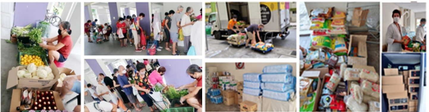
SINGAPORE WEST FOOD FOR NEEDY SECOND COLLAGE IF SPACE PERMITS