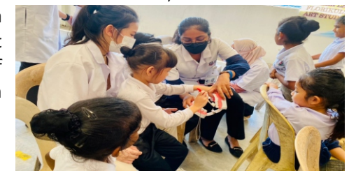
Dental students engaging with the pre-schoolers from