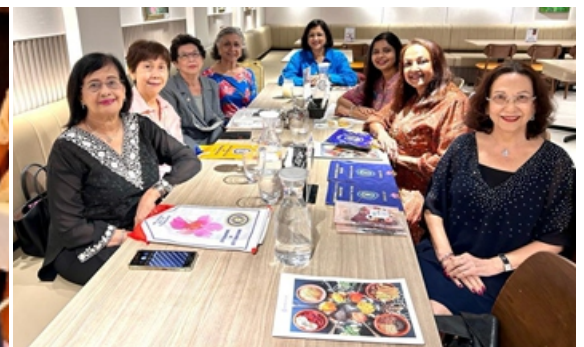
IWC SINGAPORE WITH D 329 INDIA