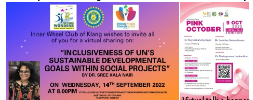
Digital Brochure of Webinar