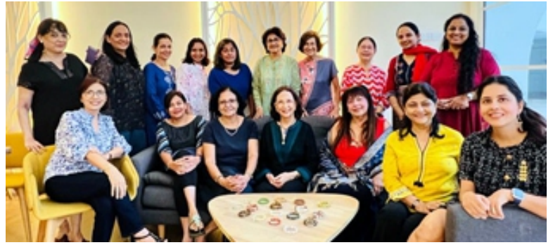
BEAD BRACELET IWC SINGAPORE

Both IWC Singapore and IWC Singapore West hosted members from different D 304 and 329 of India