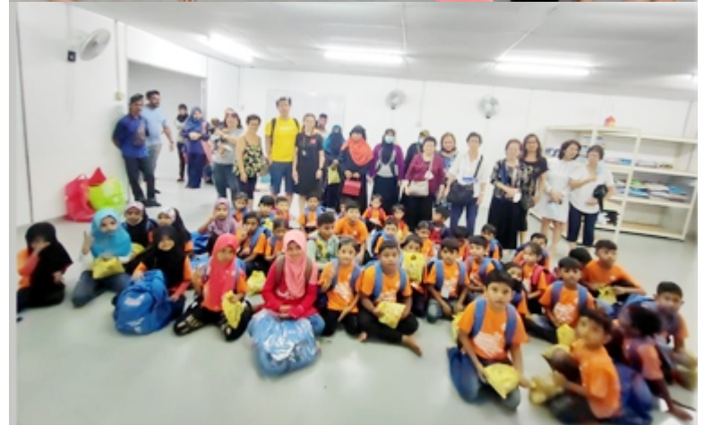
IWC SINGAPORE EAST RELIEF TO ROHINGYA