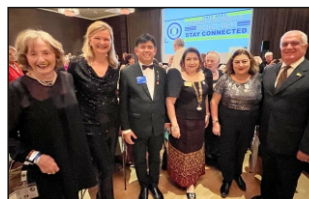
The Philippines, Italy and Germany connect at the Gala Evening