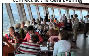
Farewell Lunch in the revolving TV Tower