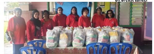
IWC of Kuantan Indera Mahkota ready to distribute