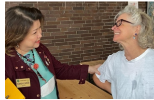
IIW President and chef of the Franciscan Monk's Soup Kitchen for homeless