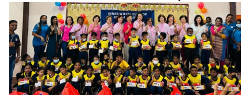
IWCKL members, children & families