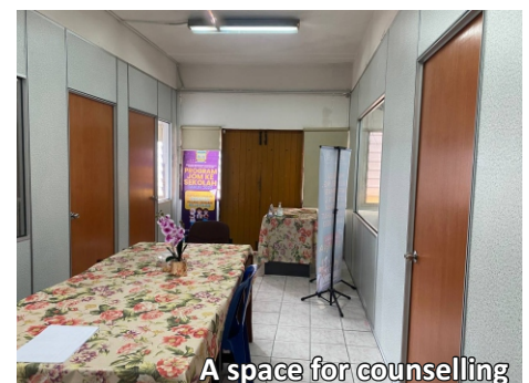
A space for counselling

IWC of Subang , Selangor initiated proposal to help SMK Taman Sri Muda in Kuala Lumpur affected by floods. Funds were raised with the help of Rhythm Foundation to assist the school. After six months, the students have now a well-equipped room to access counselling and other activities.