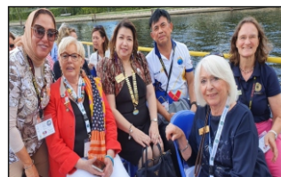
Sightseeing on the Riverboat Tour