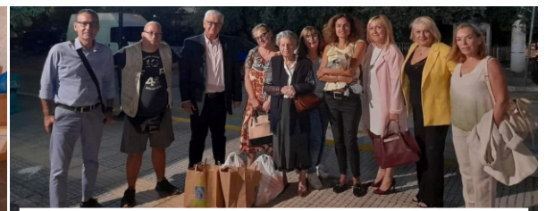
Donation of the supplies by members of our Club to the Municipality authorities