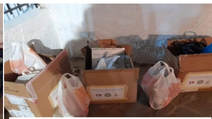
Supplies offered by the members