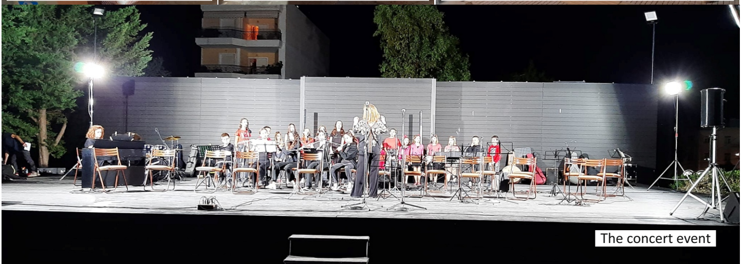
The concert event