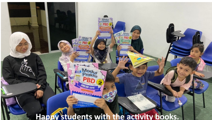
Happy students with the activity books.