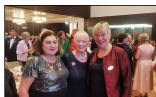
Internationality at its best