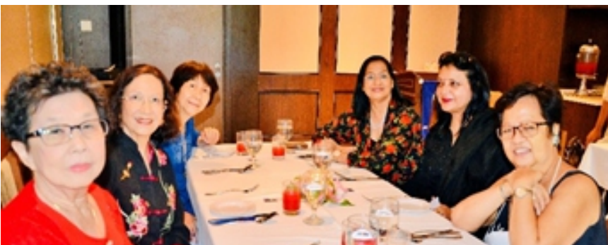
FRIENDSHIP OVERSEAS (IWC SINGAPORE WEST WITH DC, D 329 INDIA)