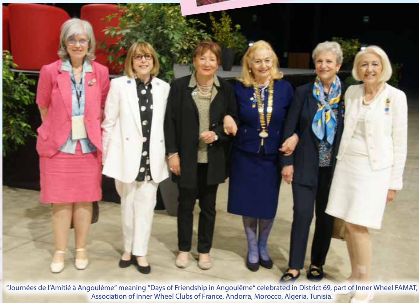
"Journées de l'Amitié à Angoulême" meaning "Days of Friendship in Angoulême" celebrated in District 69, part of Inner Wheel FAMAT, Association of Inner Wheel Clubs of France, Andorra, Morocco, Algeria, Tunisia.