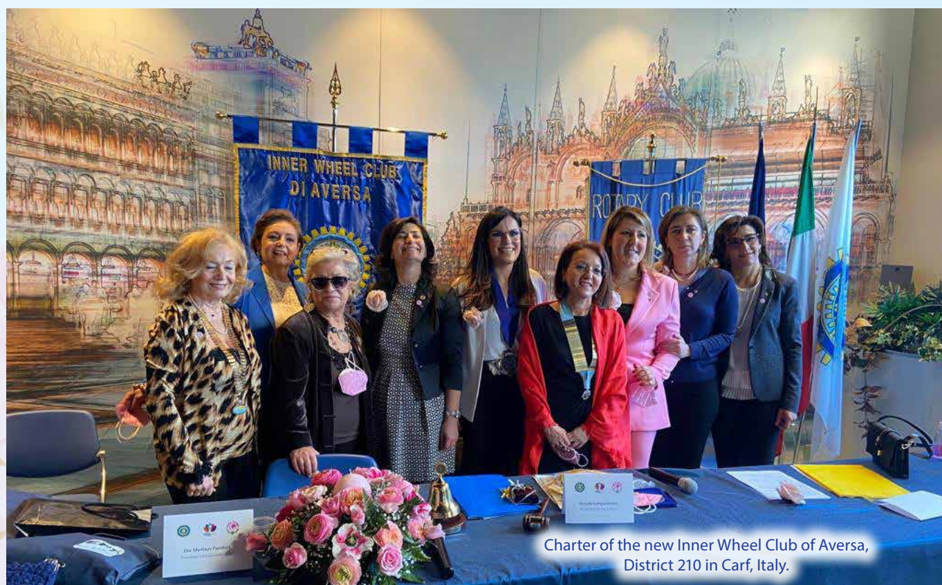
Charter of the new Inner Wheel Club of Aversa, District 210 in Carf, Italy.