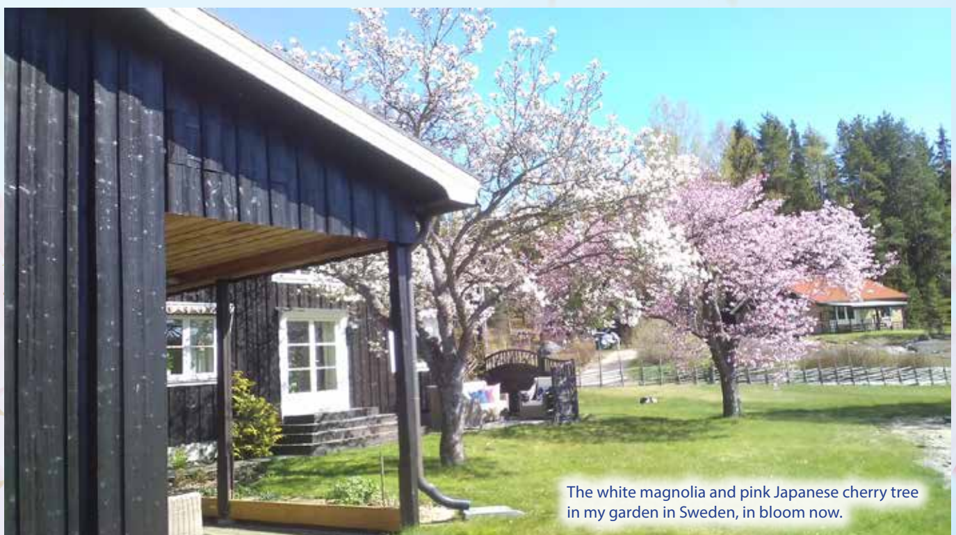
The white magnolia and pink Japanese cherry tree in my garden in Sweden, in bloom now.

Constitution Chairman 2021-22 International Inner Wheel