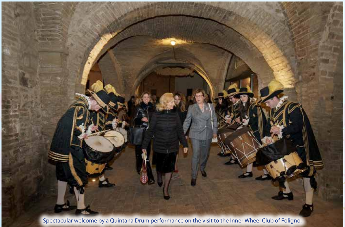
Spectacular welcome by a Quintana Drum performance on the visit to the Inner Wheel Club of Foligno.