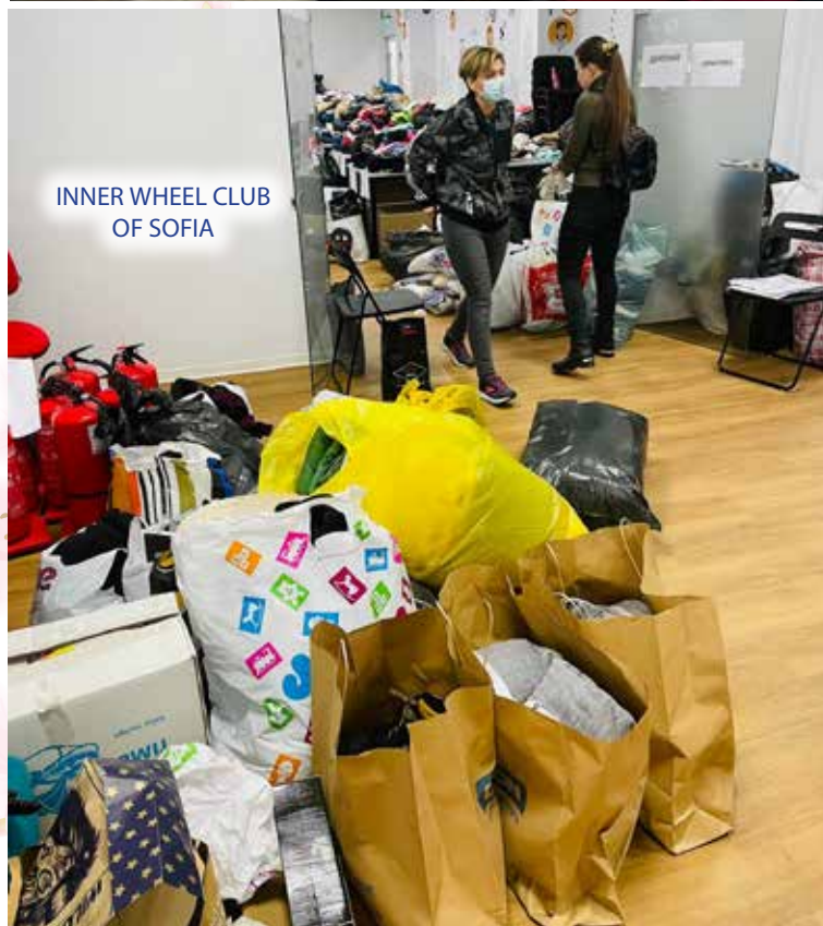
INNER WHEEL CLUB OF SOFIA