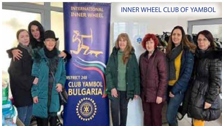
INNER WHEEL CLUB OF YAMBOL