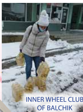
INNER WHEEL CLUB OF BALCHIK

Photo shows a member of the Inner Wheel Club of Balchik with supplies. The winter snow did not stop members from extending their hand in aid.