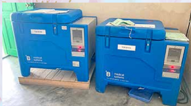
Special vaccine freezers, purchased using the IIW COVID-19 DVF.