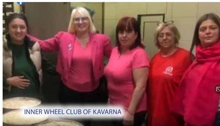
INNER WHEEL CLUB OF KAVARNA