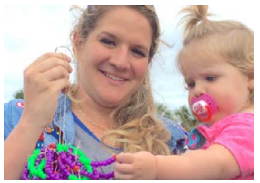
Members make bracelets that help women track their time of monthly fertility

After speaking at a District 696 Bahamas after this summer's hurriis an ongoing project with no end