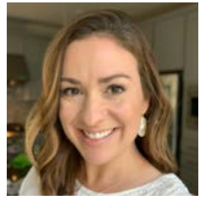
meetings and conferences held at the UN Headquarters in New York and submit reports to both IIW and IWUSA after each meeting.